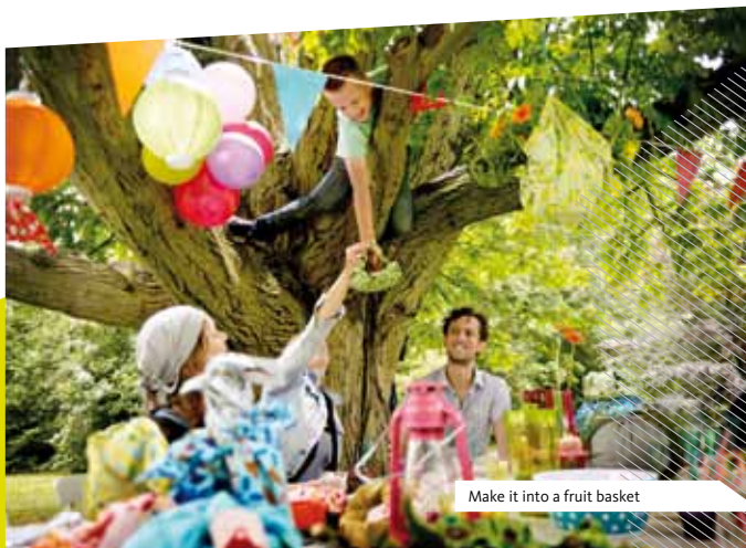
Make it into a fruit basket

A new concept which turns every gift into a surprise.