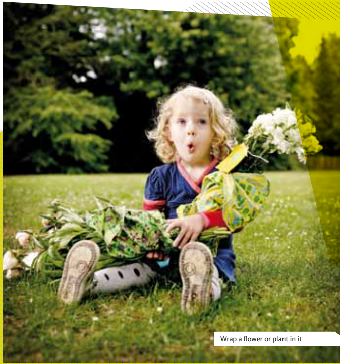
Wrap a flower or plant in it