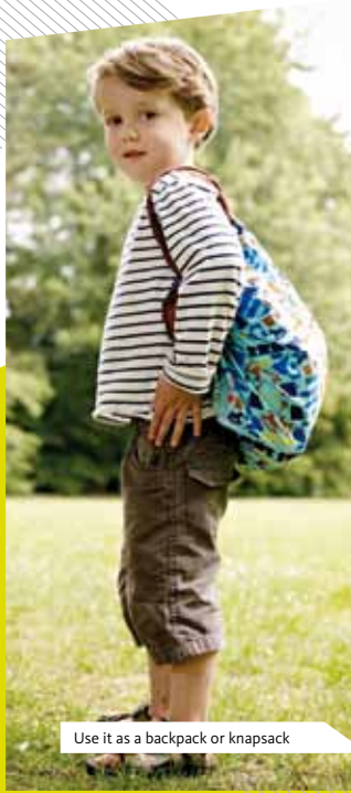
Use it as a backpack or knapsack